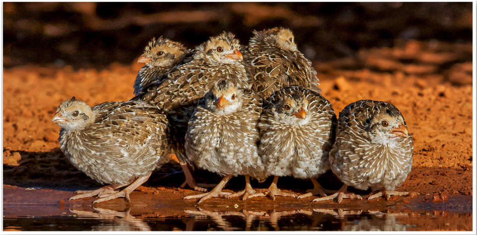
Quail chicks almost ready to be released. Wouldn't it be lovely to have them running all over Long Island!

THNC, a 501c3 environmental education organization is happy to accept donations to support their quail restoration project. For more information about them and their programs, visit www.thirdhousenaturecenter.org and follow them on Facebook and Instagram.