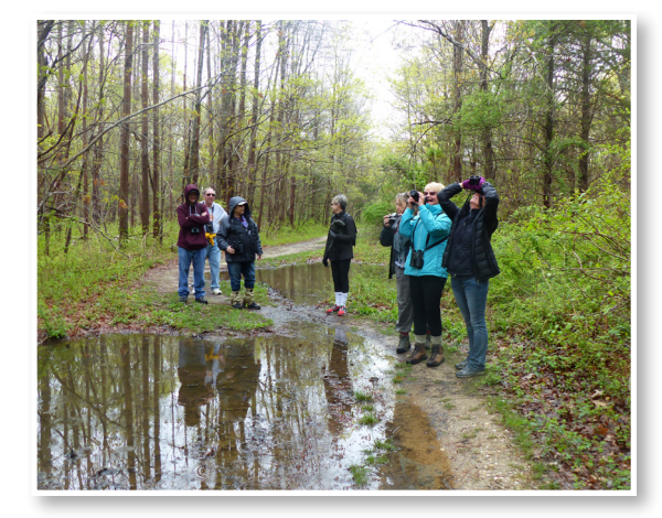
On May 4 it was on to the Rocky Point DEC Area. It was chilly but the rain held off. Eight species of warblers were spotted including a Northern Waterthrush.

Hunters Garden is always an interesting, out of the way place to visit. On May 19 we visited this nice and woodsy spot. It is, indeed, far from the madding crowd. Scarlet Tananger and Baltimore Orioles were spotted here. The most cooperative bird for a photo was the Cedar Waxwing. The most unusual was a Chestnut-sided Warbler. The sign is well-hidden off the circle that is about a mile off of Route 51.