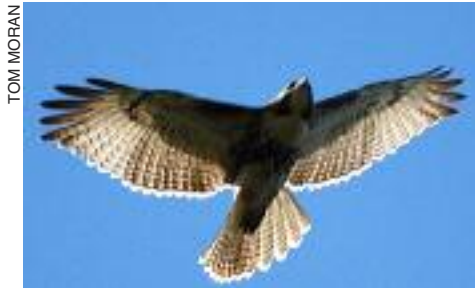
An immature Red-tailed Hawk soars over Hook Mt.

Although the winds were from the south and the counts for the varied species were not high, the number of species, the views afforded, and behavior were exceptional. Some of the species we enjoy at Fire Island were present: American Kestrels, Peregrine Falcons, Ospreys, Sharp-shinned Hawks, and Coopers Hawks. Black Vultures were present in good numbers as well as Turkey Vultures. Several mature Bald Eagles and an immature Bald Eagle soared by. Surprises included the croaking of passing Common Ravens and a brief visit by a Red-breasted