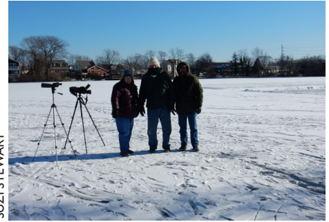
Lakes around Patchogue, January 10, 2015