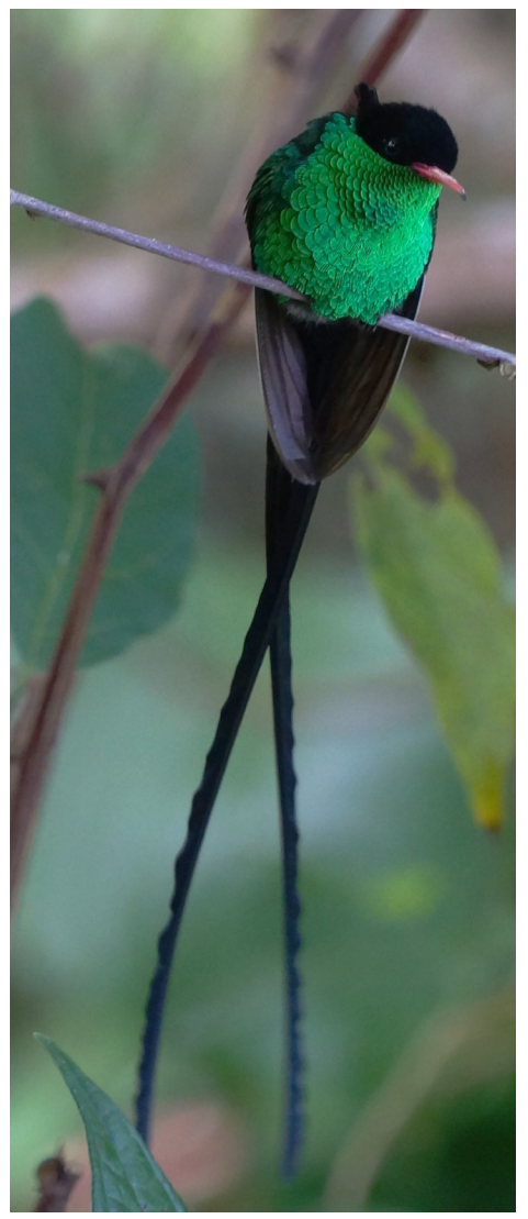
We should meet this spectacular Streamertail Hummingbird, endemic to Jamaica, on our first morning of the trip. Below, another beautifully colored endemic with red under its chin, and a red wing patch bird, the Jamaican Tody, is a frequent visitor to the local gardens.