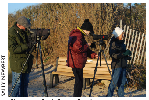
Christmas Bird Count, Southampton, December 13