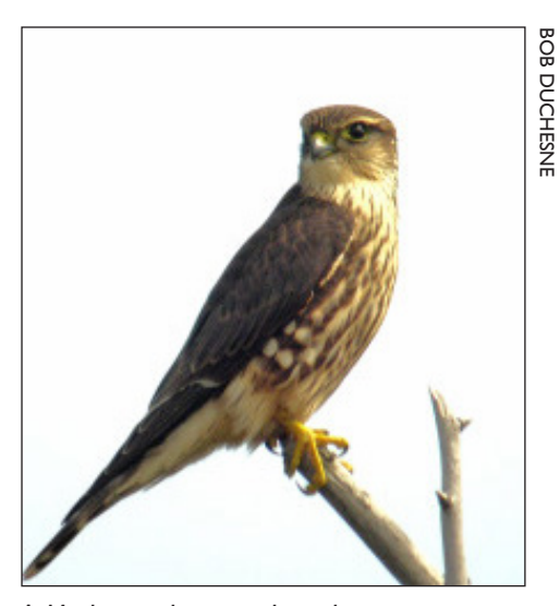
A Merlin perches on a branch.

Falcons have sleek, pointed wings. They are built like jet fighters, and they fly that