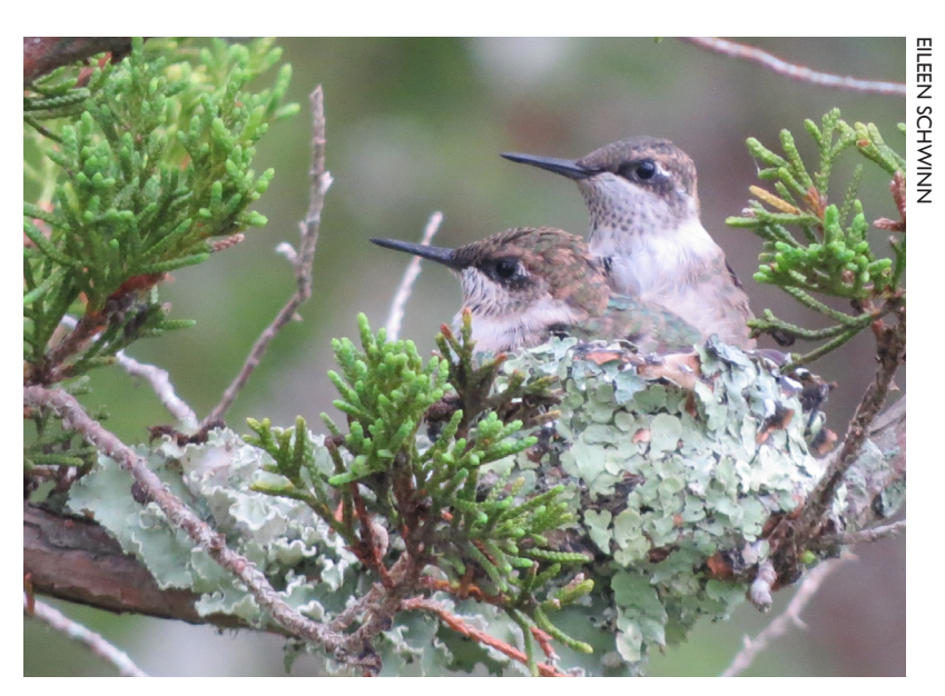
Two of the young Ruby-throated Hummingbirds that fledged in East Quogue this summer in their lichen covered nest