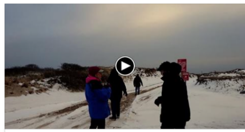
2017 Christmas Bird Count Quik by GoPro is the easiest way to create beautiful videos