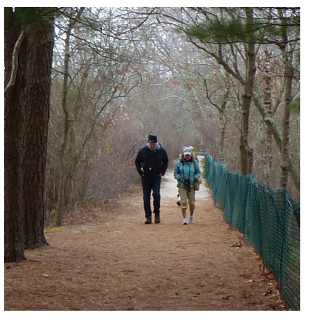
Don and Gigi Spates on a cold spring morning in May 2016 on the trails at Quogue Wildlife Refuge.

Lastly, a wonderful moment in time we spent with Don and Gigi was when they came over to see the dance of the woodcock. We had just moved into the house and there were woodcock down the road in an old fallow field. Don had never seen the courtship – flight