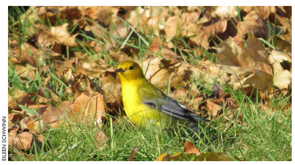
Prothonotary Warbler at the Suffolk County Farm in Yaphank.

It is important to remember when out birding, especially after a major storm to keep your eyes open for potential vagrants, one never knows what will pop up along our shores.