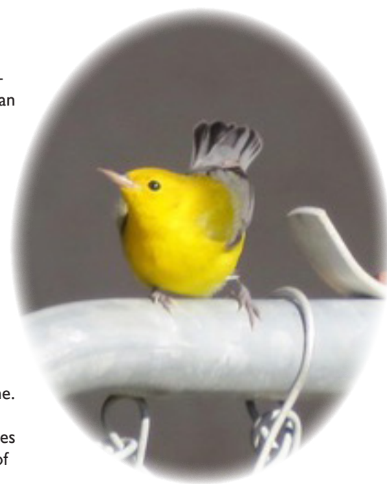
The Prothonothary Warbler was not shy and reportedly flew around observers' feet.

How did this bird get to Yaphank? We will never know! It may have gotten hooked up with the wrong migrating flock, been blown off course by storms in late summer or early fall, or just mixed up his north with his south – the proper direction for migration. Usually shy and rather reclusive, this particular bird – seen here and photographed on Dec 1, 2017 – was just the opposite! Hunting insects among farm equipment, animal waste piles, and an empty building, it frequently was reported as flying around human observers' feet, and clinging to walls.