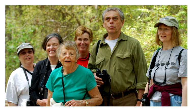
(Left) At the William Floyd Estate, the group included some high school students. (Right) At Terrell River County Park.