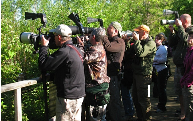
Watch the birdie! All smiles — got the bird.