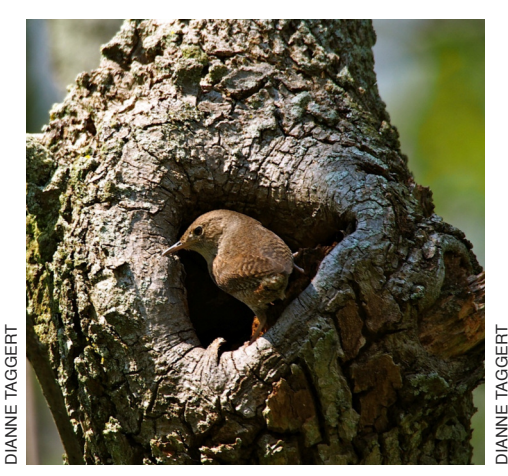
A cavity nester, the wren checks out a possible nest site.

the red Long Island resident), daytime, sleeping Whip-poor-will, Upland Sandpipers, Lincoln and White-crowned Sparrows — all nearly close enough to touch! Our first night there, while arriving at the hotel after a long day of birding, we swore we heard American Woodcock, pneening nearby. How could that be? Middle of a down-town?? No open fields nearby? Too tired to look (you KNOW it had to have been a long day if we were too beat to head out to find the source). Mystery solved on our last night — arriving after 9 pm, we again heard the pneening, and looking up, two Common Nighthawks were grabbing bugs attracted by the exterior hotel lighting! Flying in unison, they were vocalizing, sounding just like Woodcocks! They continued to be heard through the night, and again, just before dawn on the