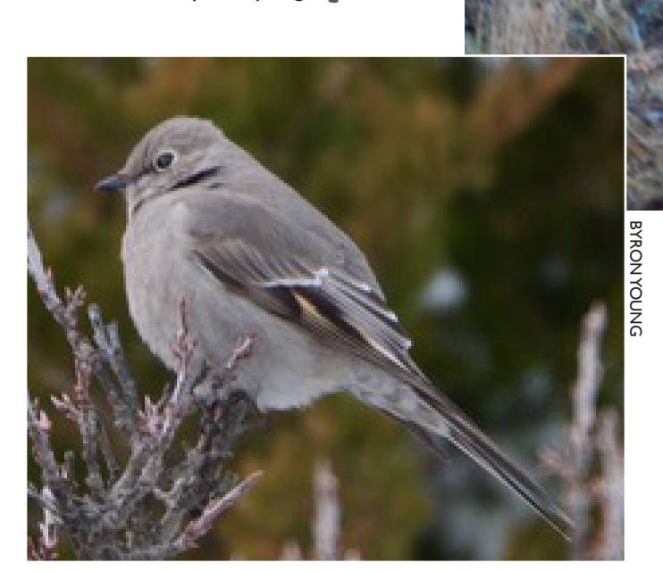
(top) The Sandhill Crane standing tall in Wainscott. (left) The Townsend's Solitaire perched.

(below) Ross's Geese at Robert Moses State Park.