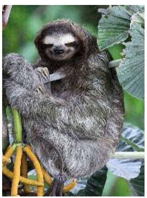
A sloth lounges in the treetops

Our next day started like all others with breakfast atop The Tower with close up views of all these gaudy exotic birds. Later we walked the road leading to The Tower and found all kinds of manakins, thrushes, antshrikes and toucans. After lunch we took a trip to Summit Gardens and its Harpy Eagle display. What an impressive bird! Too bad we never got to see one in the wild. The grounds proved excellent for a variety of trogans and woodcreepers. We also found some Tent-Making Bats taking refuge under their homemade tent in a Palm Tree. After dinner we took a drive to