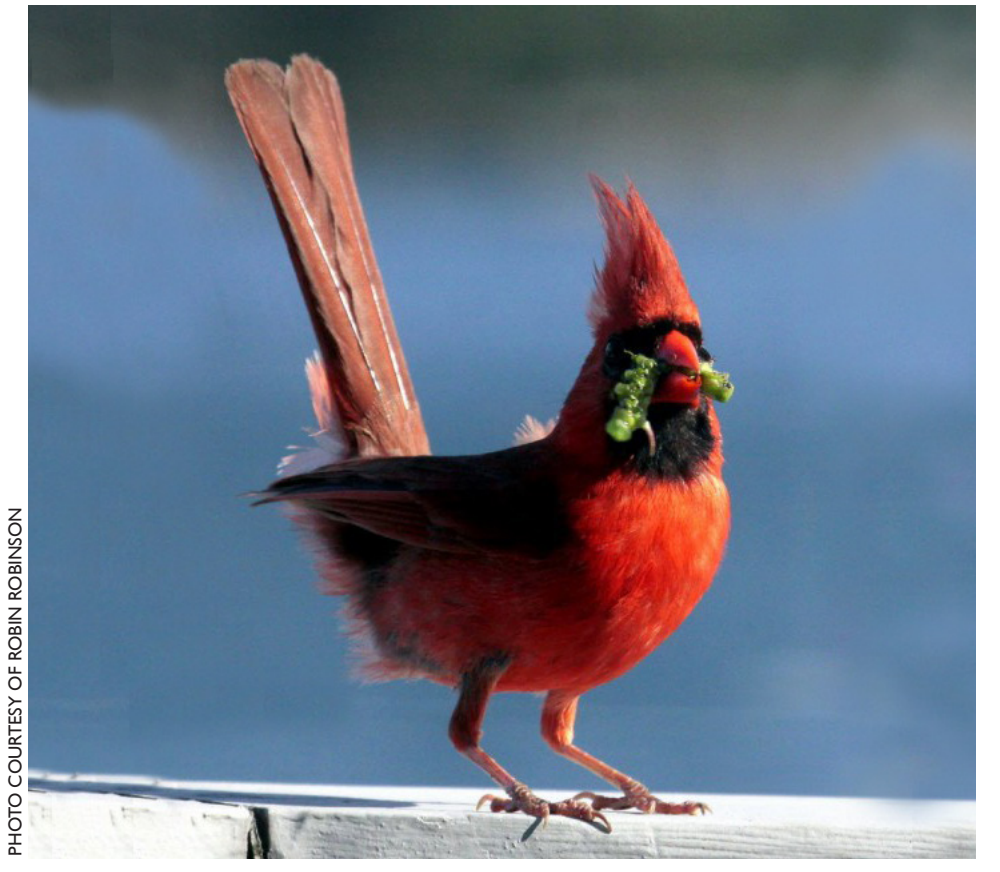
Cardinals are common in the northeast now, but originally were limited to the southeastern U.S. It is the state bird of seven states.