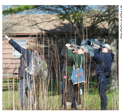
Continued on page 4

"Its right there, it's the bright yellow bird" at Wertheim NWR.