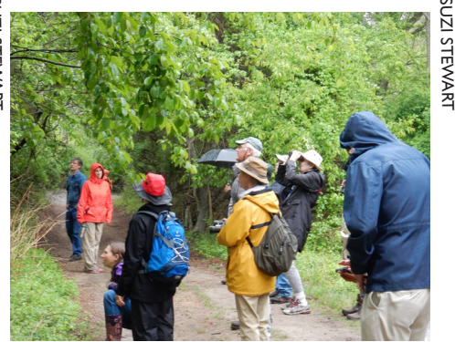
At Hallockville & Hallock State Park