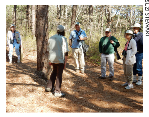
At Quogue Wildlife Refuge

species, which kept the morning moving. Among them were: a number of Scarlet Tanagers and Baltimore Orioles. The highlights included one or possibly two Blackburnian Warblers, two Northern Parulas, a Great-crested Flycatcher., Eastern Tohwee, House Wren, Blue-gray Gnatcatcher and Chipping Sparrow.