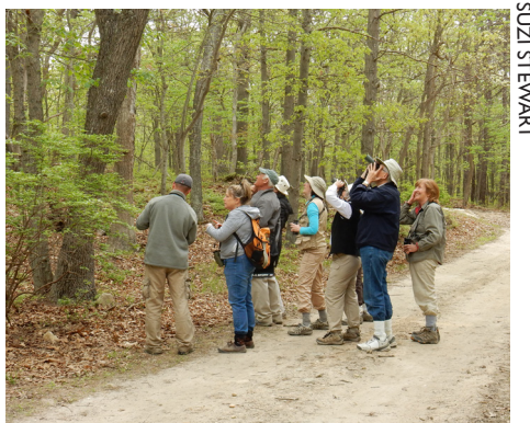
At Hunters Garden

While the rain did stop, it stayed a gray/ dull day, with the bird counting slow, although we did get a number of "bright"