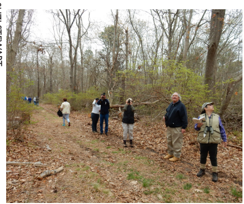
At the William Floyd Estate

We then decided to see if the Bald Hill Area (also on the west side of RT. 51, but about 1/2 mile to the north) was busier than Hunters Garden. It has a large wet area, but the short answer was no. Pine Warbler was the lone addition to the day's tally.